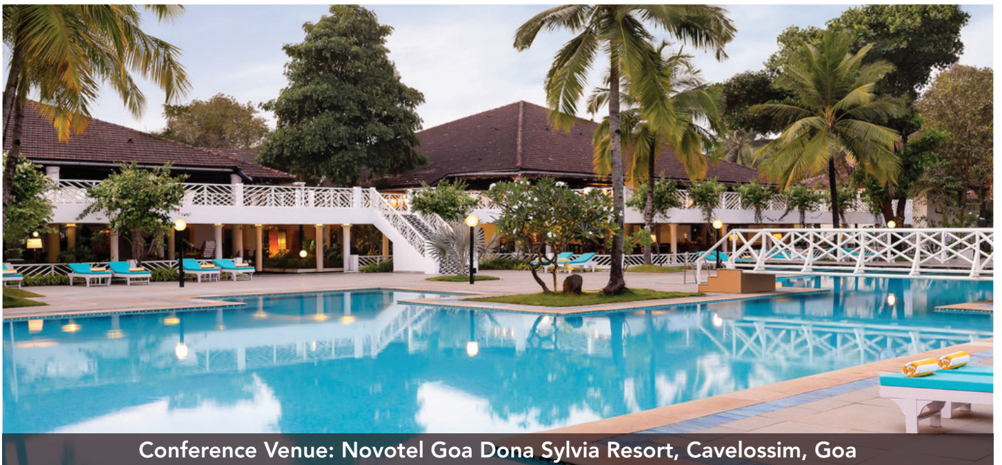
Conference Venue: Novotel Goa Dona Sylvania Resort, Cavelossim, Goa