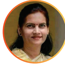
Dr. Bharati Pawar Minister of State, Health & Family Welfare