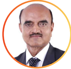
Dr. Bhagwat Karad Minister of State, Finance